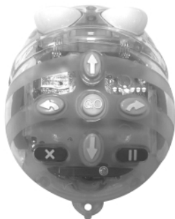
USB Charging Socket